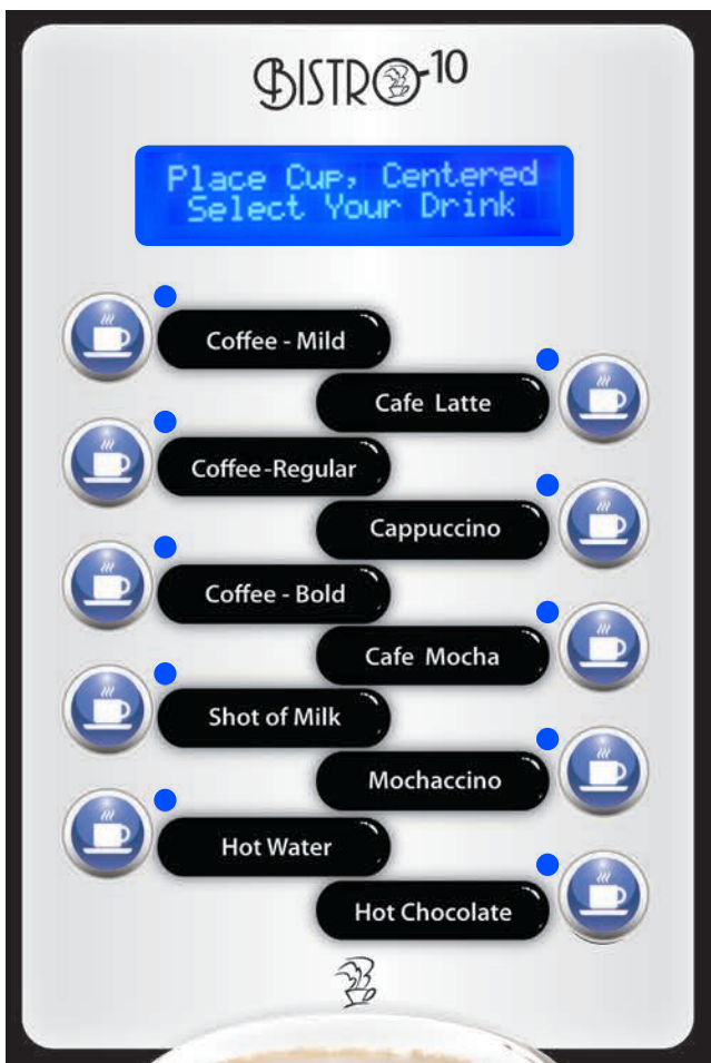
Close-up of membrane switch showing our standard drink options

Bistro 10 entire front can be custom branded with your image helping you to promote your brand and services.