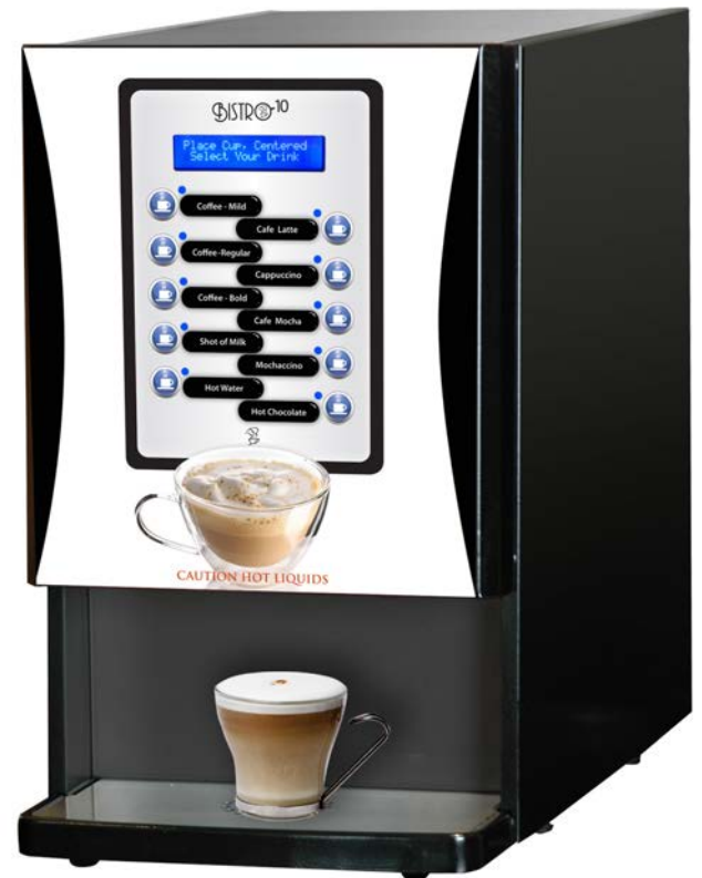
Bistro 10 PN: 123000-BPC

Burgandy Style Still Available just ask for the machine with PN: 400521 front label.