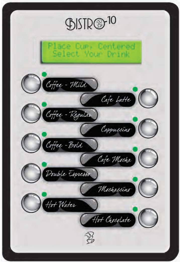
Close-up of membrane switch showing our standard drink options

Bistro 10-T's entire front can be custom branded with your image helping you to promote your brand and services.