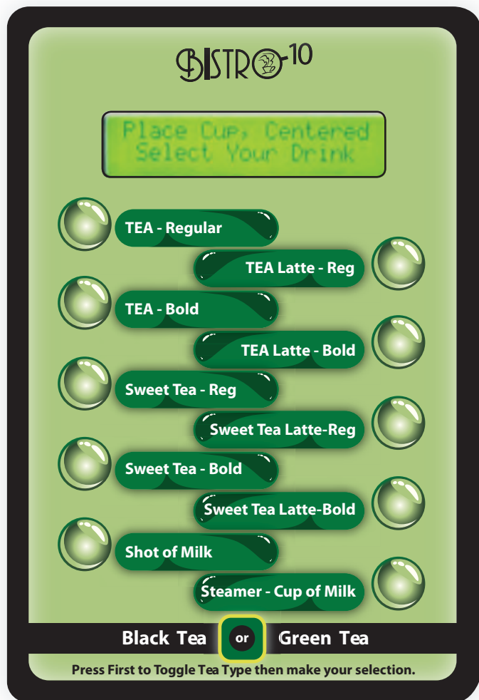
Close-up of membrane switch showing our standard drink options

Bistro 10's entire front can be custom branded with your image helping you to promote your brand and services.