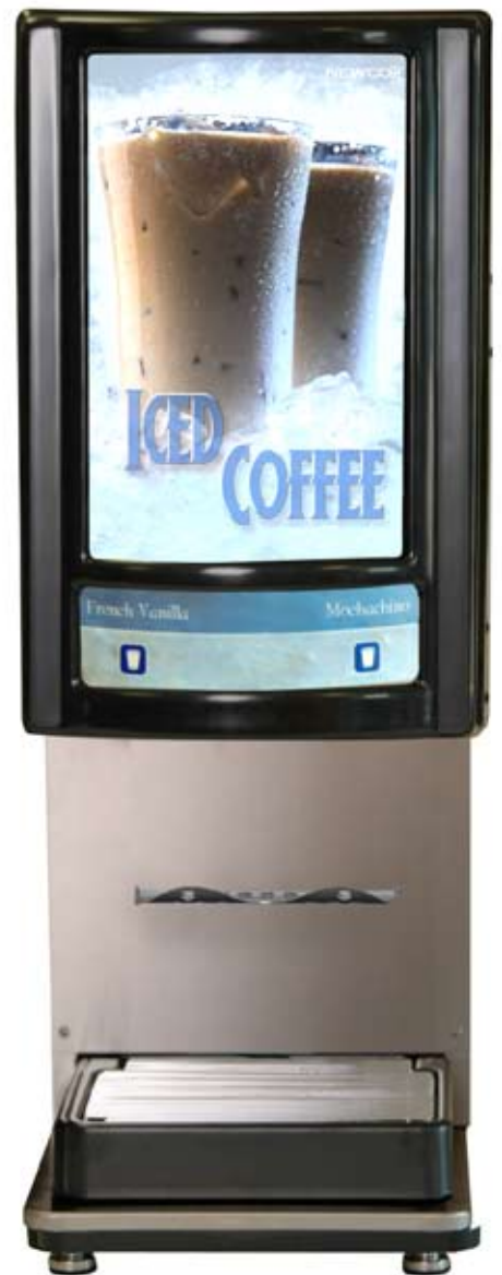
LCD-2 Ambient Only Machine