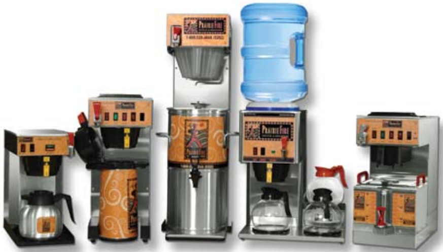
*Our customers family of branded products

Call your Customer Service rep today 800.325.7867