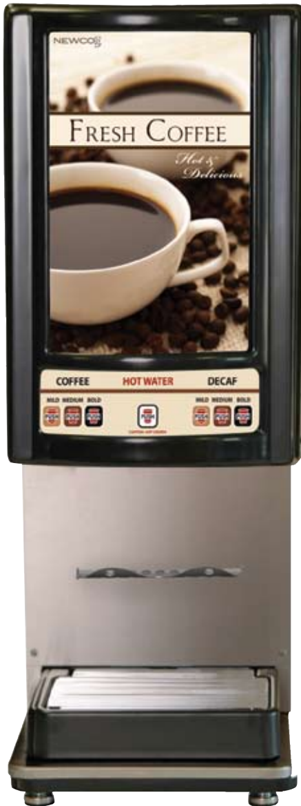
LCD-2 Hot Machine