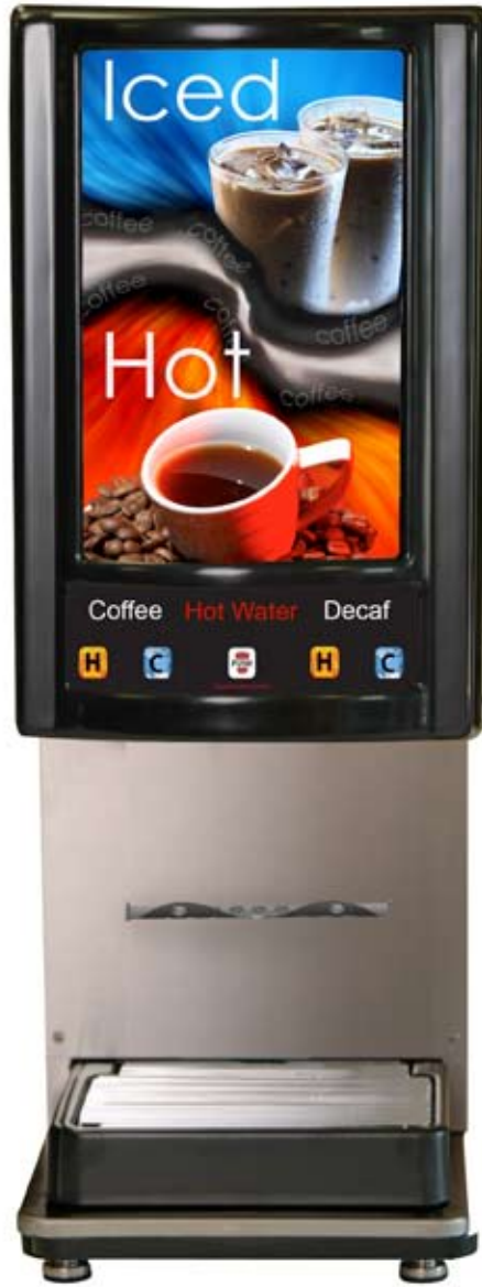
LCD-2 Hot and Ambient machine