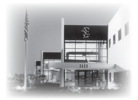
Made in the USA

The AKH models of brewers to satisfy customers request for a simple functioning pour over brewer suited for the office/ home environment. This series incorporates a heat pump system rather than the traditional displacement hot water tank system.