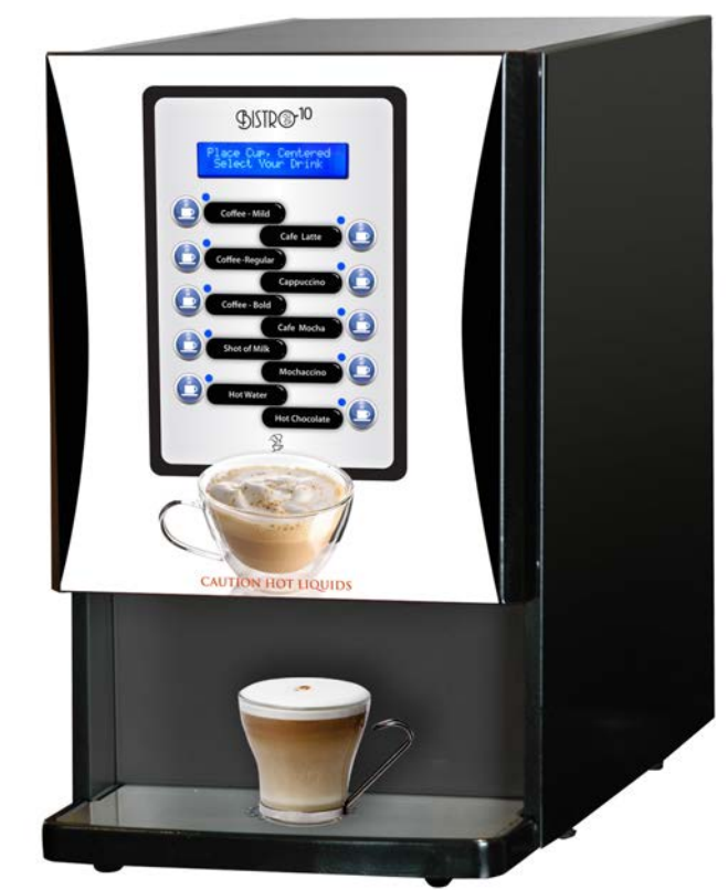
Bistro 10 PN: 123000-BPC

Burgandy Style Still Available iust ask for the machine with PN: 400521 front label.