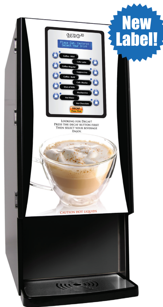
Bistro 10-T PN: 123033-BPC