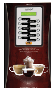
Burgandy Style Still Available just ask for the machine with PN: 123046 front label.