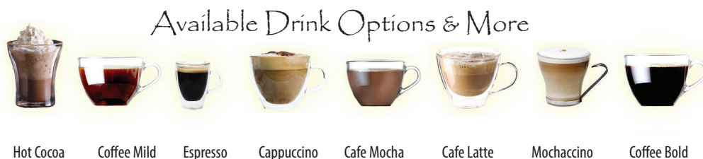
Available Drink Options & More