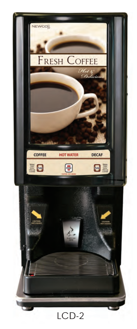
Ask about our other models too.