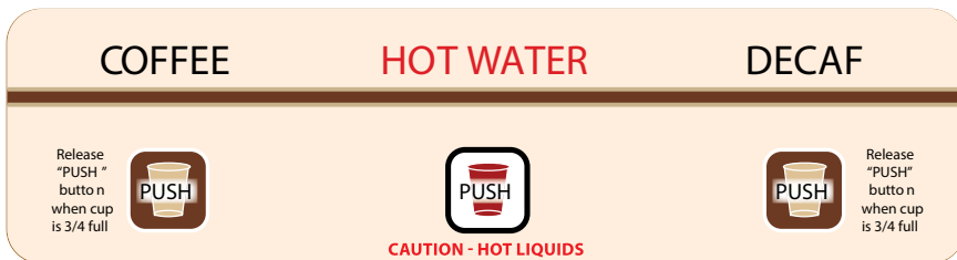
PN: 120351 Newco LCD-2 Hot Machine standard label