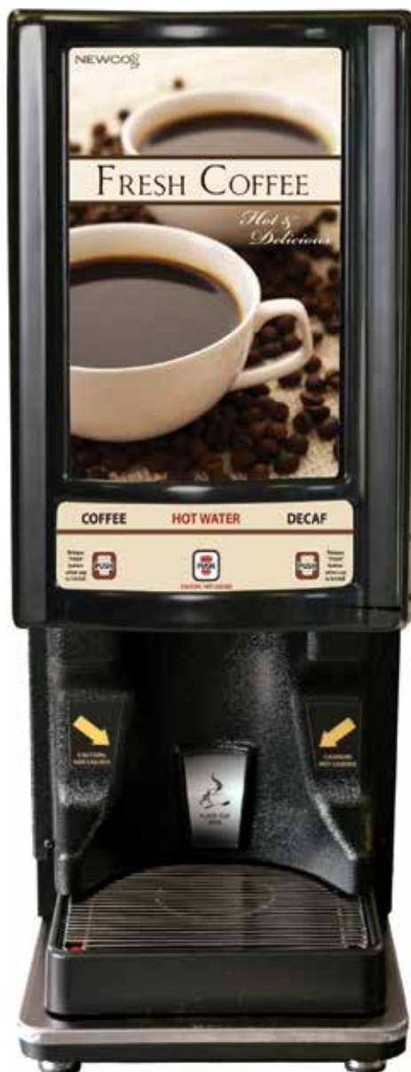
LCD-2 Hot Machine 120V #120309 240V #120354

All Newco LCD-2 machines shown here with standard branding and switch labels.