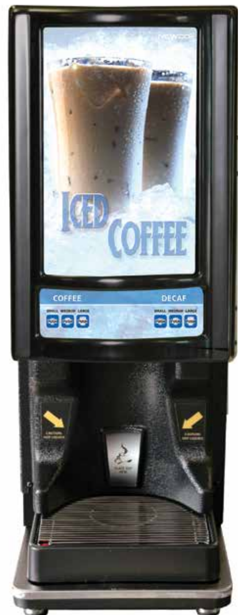
LCD-2 Ambient Only Machine 120V #120463