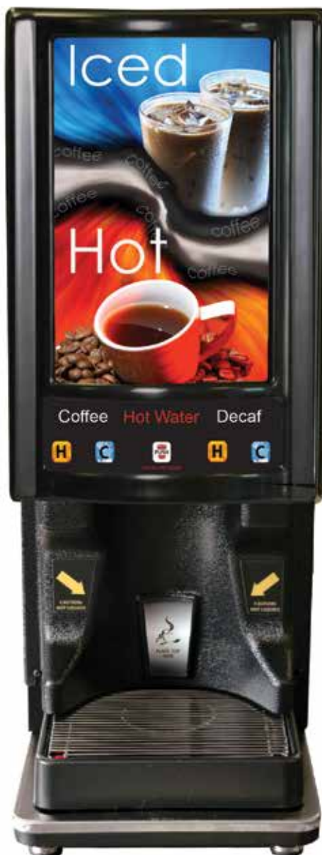
LCD-2 Hot and Ambient Machine 120V #120441 240V #120449