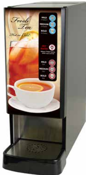
LCD-1, Hot / Ambient TEA PN:121330