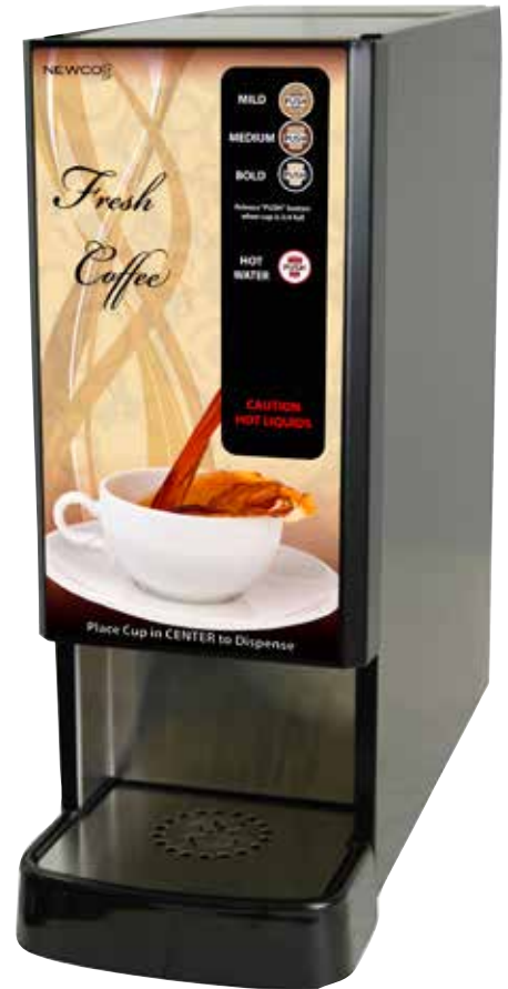
LCD-1, Hot PN: 120894

The only thing required is to choose the options that are right for you.