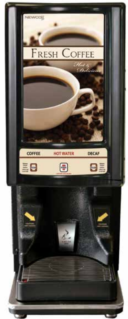
Newco LCD-2 Hot Machine shown here with strength label - Mild, Medium and Bold.

Let us know the configuration you would like and Newco will custom build your LCD-2 dispenser at no additional charge.