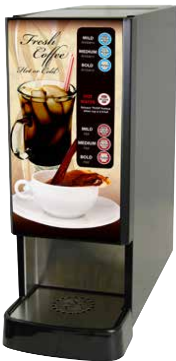
LCD-1, Hot / Ambient Coffee PN:121330