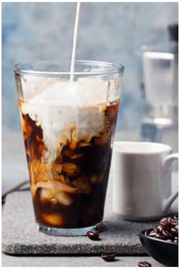
Issued 4-19-17 Revised 5-22-17