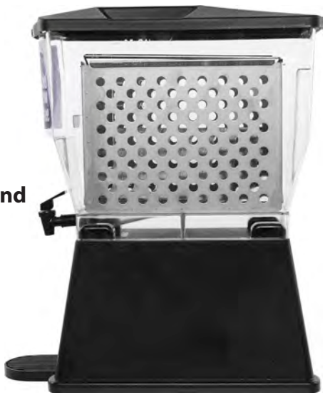
20.75" H X 8"W X 17" D

104244 Kit, COLD BREW with Sieve and Dispenser 805150 Sieve, Single Chamber 103971 Lid, Ice Bucket 110391 Dispenser, Slim, 3 Gallon, with stand 401615 Label, for Dispenser reads: COLD BREW COFFEE