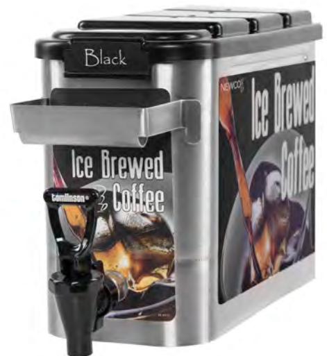
3 piece wrap shown here.