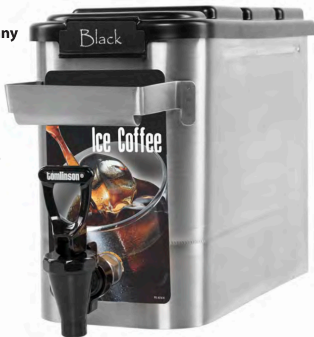
9.6" H X 6" W X 16.7" D