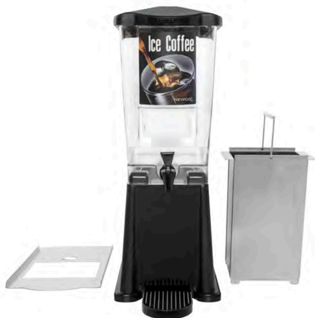
20.75" H X 8" W X 17" D