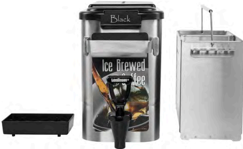
9.6" H X 6" W X 16.7" D

Order with stand 805044 for easy dispensing.