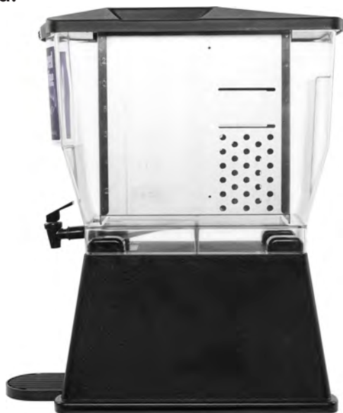
20.75" H X 8" W X 17" D