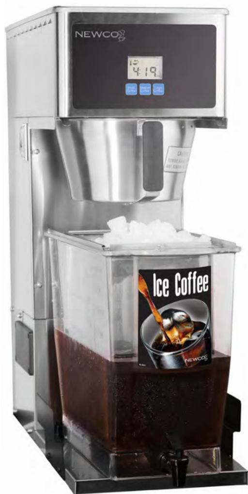
Shown here with the TVT Combo