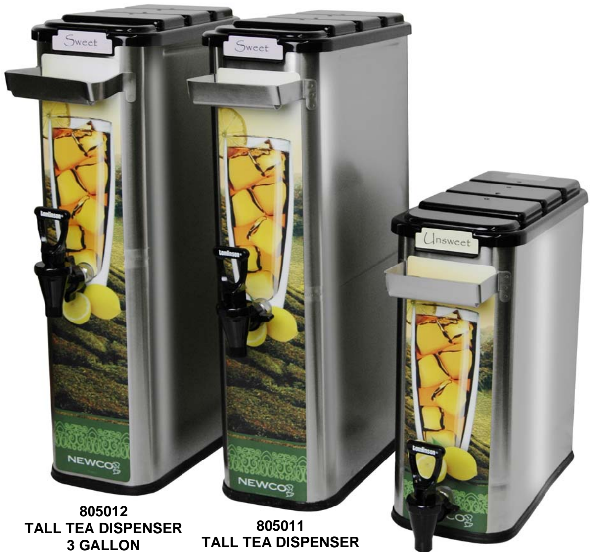
805012 TALL TEA DISPENSER 3 GALLON WITH HIGH PROFILE SERVING FAUCET