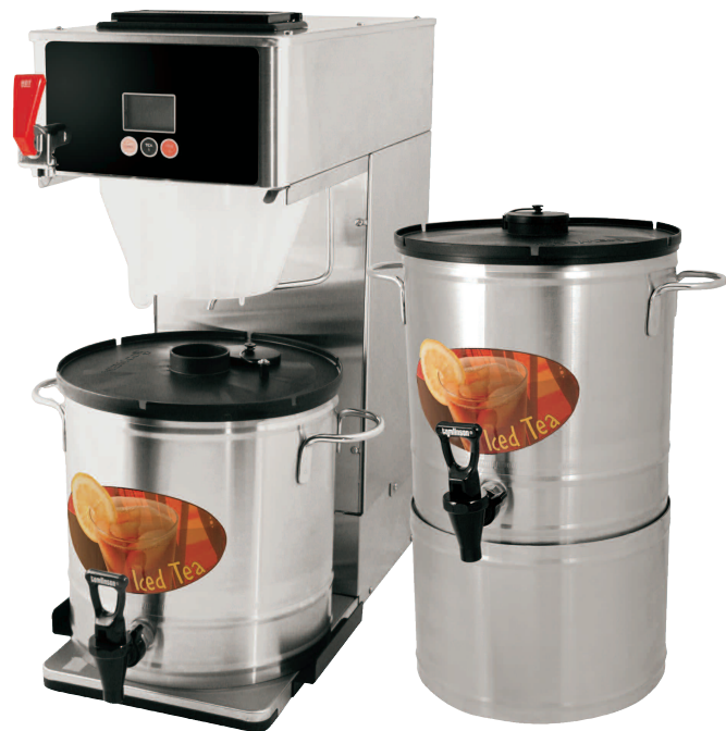
Stackable Variety Tea Urns

3 independent brew buttons can be customized with product labels for ease of brewing.