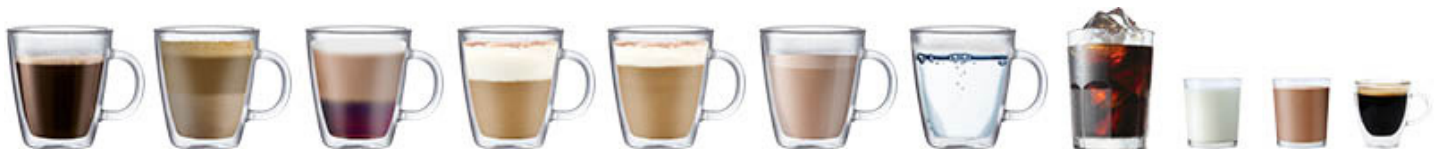
Coffee Cafe Mocha Mochaccino Latte Cappuccino Hot Coco Hot Water Iced Coffee Milk Shots Espresso

The engaging and intuitive touch screen allows consumers to easily choose a beverage and customize the size and strength of each drink. Allows up to 3 drink sizes (6oz to 20oz) and strengths (mild, regular and bold) to be visible on the screen to the consumer. Bistro Touch also allows drink sizes and strengths to be disabled in programming for locations that want to serve only one cup size or a specific strength.