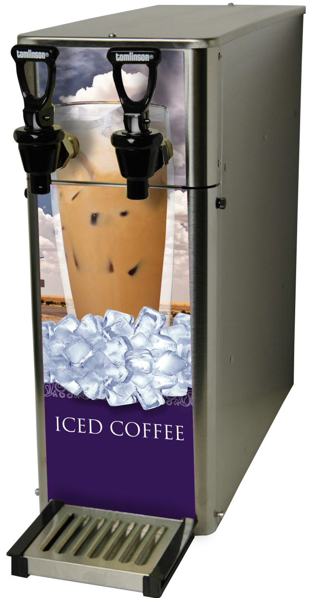
706661 Coffee, Front Load, 2 Faucet