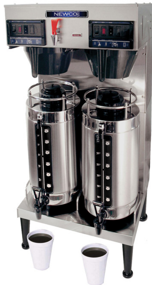
GXDF-8D PN: 701855 Shown with: Econo 2 gal with sight gauge: 111943

Thermal Satellite: Available in a 2.2 gallon design, this stainless steel lined container is the latest in high volume thermal dispensing. Being a true "air-void" container, the temperature holding capability rivals conventional glass lined thermal airpots. Equipped with a brew thru lid and a special insulated faucet for maximum heat retention, the container ensures high volumes of coffee to be served hot and fresh throughout the day.