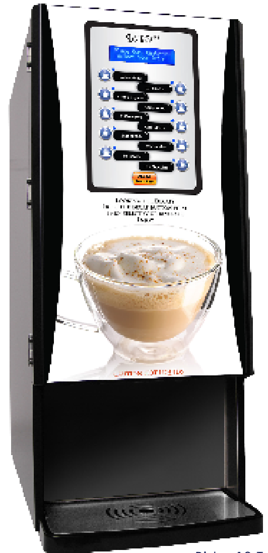
Bistro 10-T PN: 123033-BPC