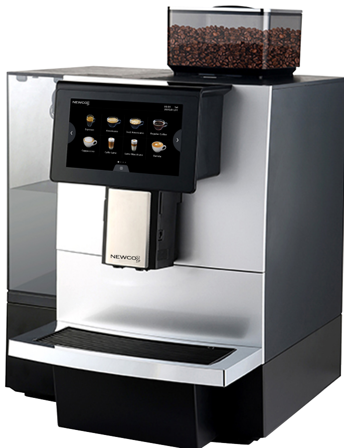
Cafe Espresso 2.0 PN: 152874

The Café Espresso 2.0 is small in size but big on flavor. With the innovative fresh brewing technology, this stylish unit delivers a range of high quality, rich tasting specialty drinks. Designed for the rugged commercial environment, Café Espresso 2.0 can deliver coffee house drinks throughout the day. The state-of-the-art touch screen intuitively allows users to navigate drink selections and even customize drink parameters such as strength, size and milk foam to deliver the perfect personalized drink. A large 8 liter water reservoir allows the unit to operate manually or connected to a main water supply. Cleaning of the brewing and milk system are displayed in simple visual instructions on the touch screen making the necessary cleaning processes easy to follow.