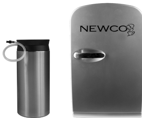
Milk Thermos 152817