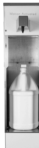
Internal sanitation reservoir