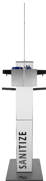
Side view of station