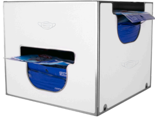
Mask Dispensing Cap Masks are not included