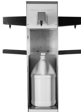
Internal sanitation reservoir