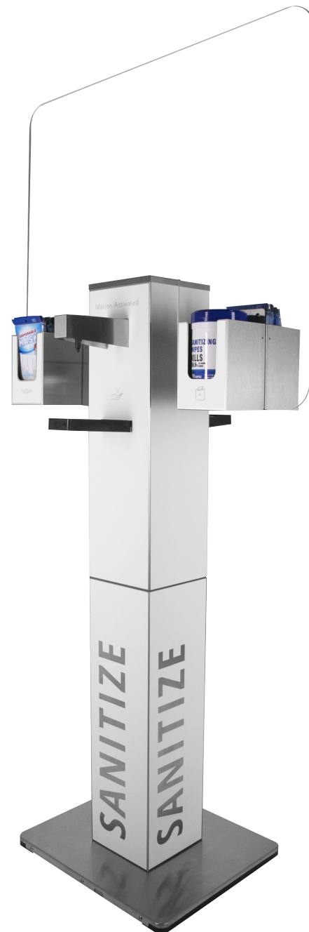
Shown with optional wipe holder and shield