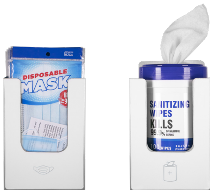
Optional mask and wipe holder Masks and wipes not included