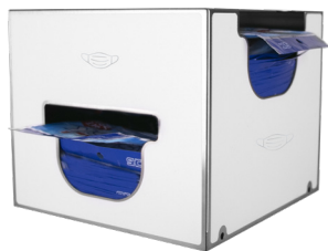
Optional mask dispenser Masks are not included