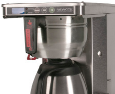
Optional Gourmet Funnel