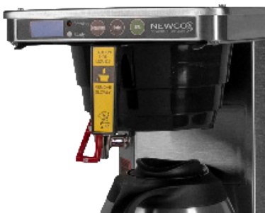
Standard Brew Basket

Set-up on the 20:1 Brewing system is easy. Simply plug in the water supply, plug in the system's built in cord (120V), and turn the machine on. The 20:1 system will sense a dry probe and begin filling the tank automatically. Once the water in the tank has reached the proper level, the element will automatically turn on and begin heating. In minutes, the correct brewing temperature will be reached, and you're ready to brew!