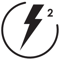
Optional Dual Voltage