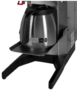
Optional Drop Down Tray