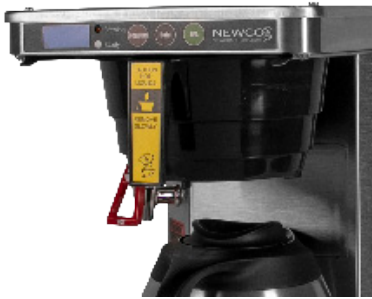
Standard Brew Basket

Set-up on the 20:1 Brewing system is easy. Simply plug in the water supply, plug in the system's built in cord (120V), and turn the machine on. The 20:1 system will sense a dry probe and begin filling the tank automatically. Once the water in the tank has reached the proper level, the element will automatically turn on and begin heating. In minutes, the correct brewing temperature will be reached, and you're ready to brew!