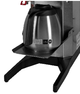
Optional Drop Down Tray