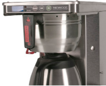
Optional Gourmet Funnel