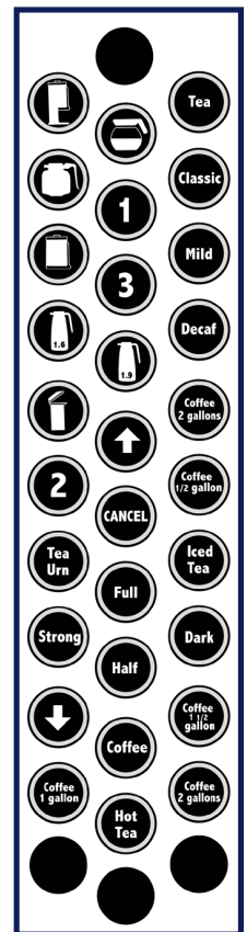
Sticker Set for changing buttons