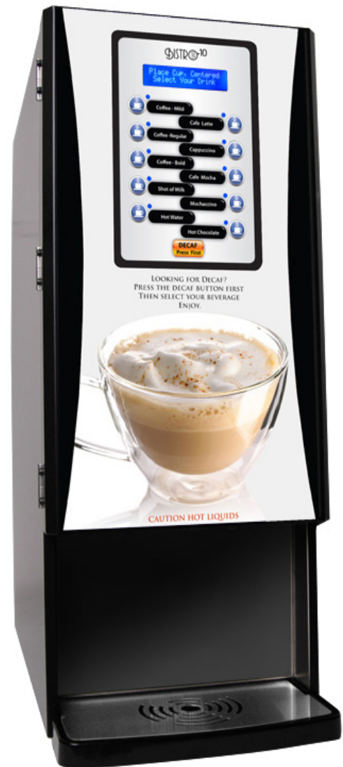
Bistro 10-T PN: 123033-BPC