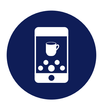
Choose drink from menu and select drink size and strength.